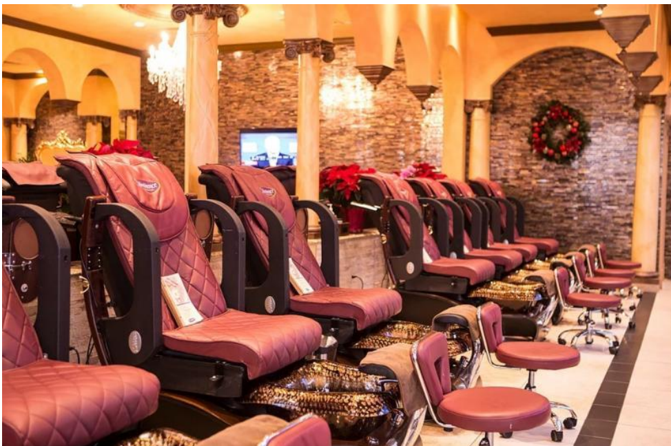
Ambiance Nail Spa

Market Wagon , revolutionizing the direct-to-consumer, locally-sourced food market with innovative shopping and logistics technology, opened a 1,470 square-foot distribution facility at 6861 Lakota Plaza Drive off Cincinnati-Dayton Road. With Market Wagon, customers shop online for local food buying it direct from farms and artisans, and Market Wagon delivers right to your home. Market Wagon