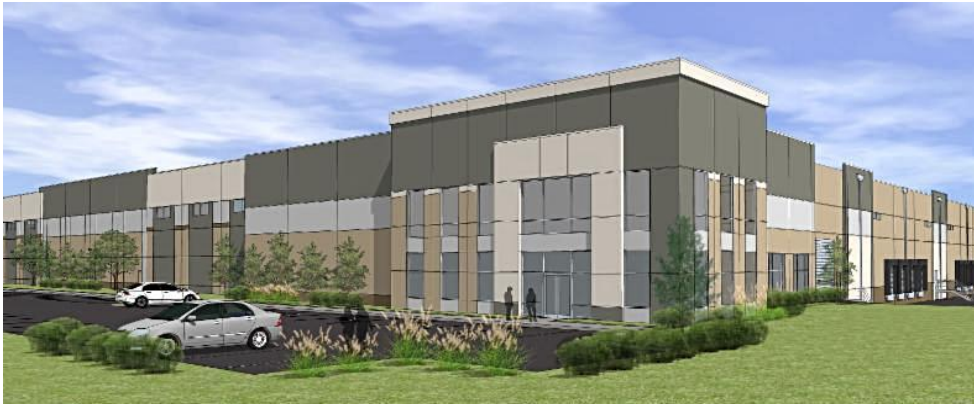
West Chester Trade Center

51,000 square-foot facility at 8494 Firebird Drive off Union Centre Boulevard. Eagle Composites manufacturing capability and capacity is focused on production of aerospace and aero engine components and assemblies. Eagle Composites