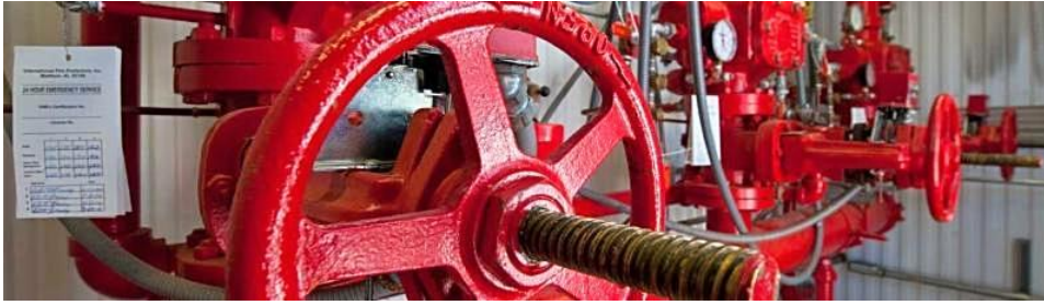
VFP Fire Systems

China and India, supplying customers in more than 76 countries across the globe. Valco Melton