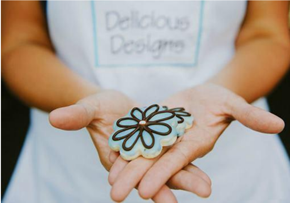
Delicious Designs Cookies

Ambiance Nail Spa offers manicures, pedicures, waxing, facials, micro blading and more. Ambiance Nail Spa