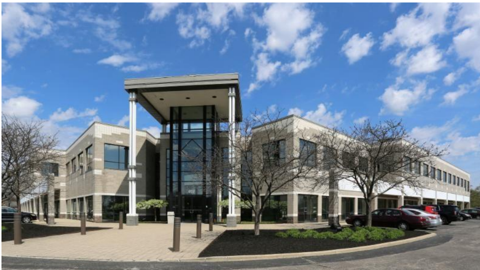
Valco Melton Corporate Headquarters

TSC Apparel , a long-recognized industry supplier of imprinted sportswear, leased a 195,604 square-foot warehouse and distribution facility at 8586 Trade Center Drive in the new West Chester Trade Center off Union Centre Boulevard. TSC Apparel is a national B2B distributor of imprinted apparel products and accessories stocking thousands of styles of casual shirts, fleeces, sports shirts and outerwear. TSC Apparel