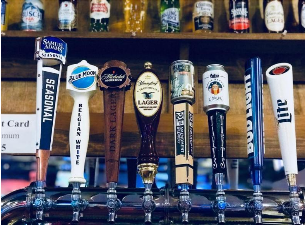
Blondie's Sports Bar and Grill

PetPeople , a neighborhood place for natural foods and quality supplies for dogs and cats, announced it will open a 3,627 square-foot store at 7996 Princeton Glendale Road in the new Crossings of Beckett shopping center anchored by Kroger Marketplace. PetPeople's team of pet enthusiasts educates by providing solutions to make a difference in the lives of pets. PetPeople