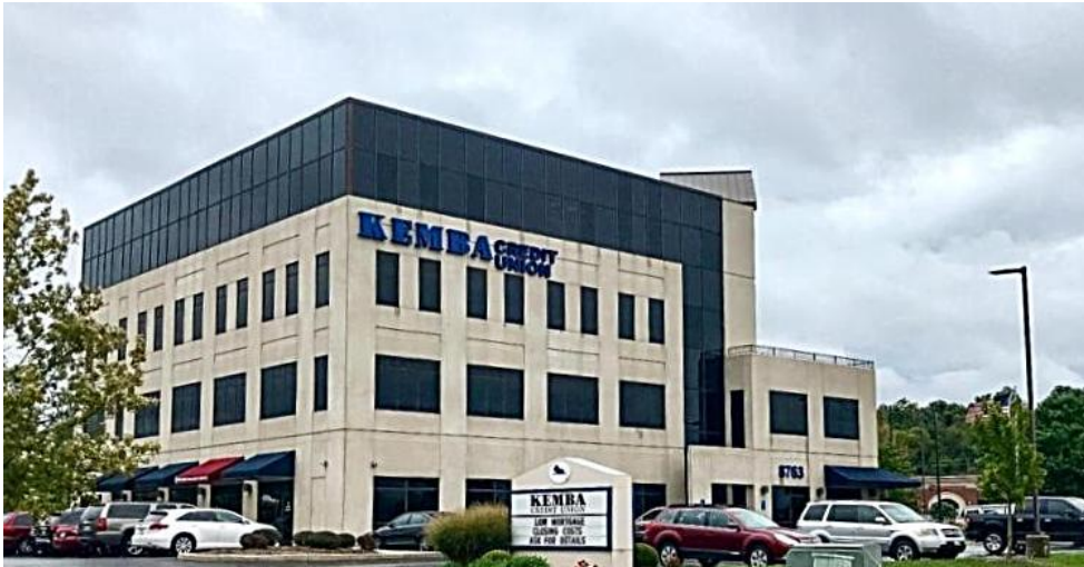
KEMBA Credit Union

KEMBA Credit Union , a not-for-profit financial institution dedicated to serving the financial needs of its members, announced it will construct a new nine-story, 90,000 square-foot Class A corporate headquarters adjacent to its existing West Chester location off Union Centre Boulevard in Chappell Crossing. KEMBA purchased nearly 6.9 acres of land for more than $1.7 million and plans to invest approximately $9.5 million for its new building and add 40 jobs. KEMBA's retail operations will remain in its existing building and the remainder of the building will be available for lease once its new headquarters is complete. KEMBA is the second largest credit union in the region serving more than 98,000 members and more than 840 companies. The new corporate headquarters is expected to be ready in the summer of 2020. KEMBA Credit Union