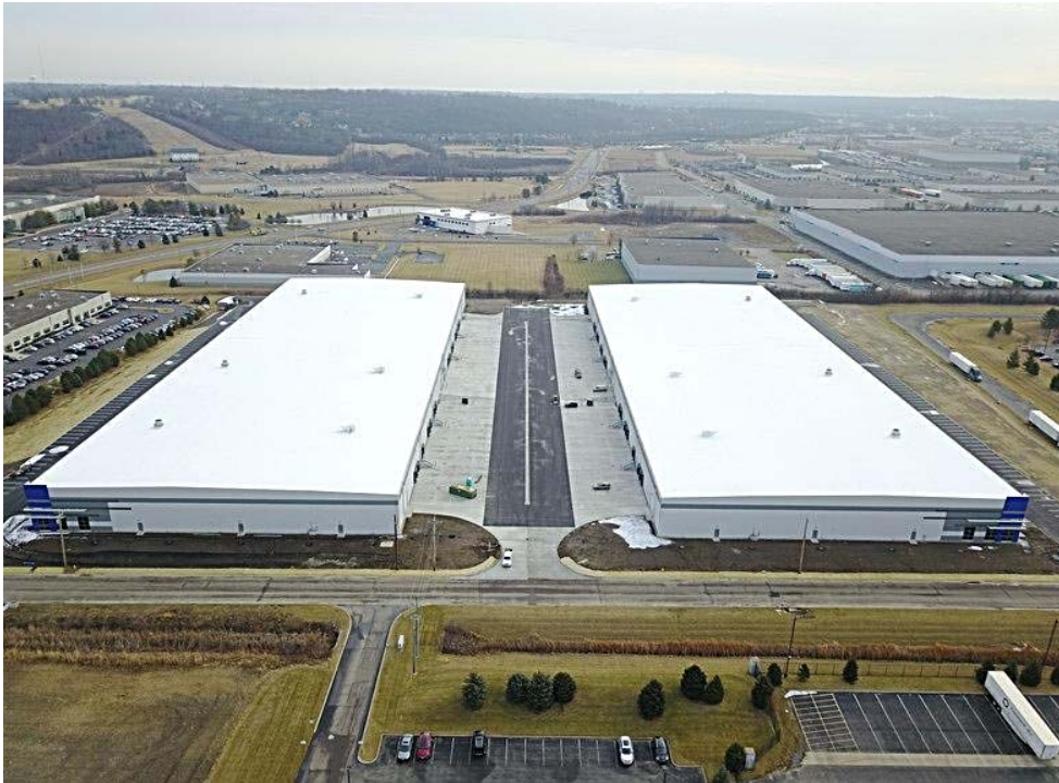
Jacquemin Logistics Center

Jacquemin Drive in the new Jacquemin Logistics Center off Union Centre Boulevard. Heritage Bag, one of the Novelex packaging brands, serves the retail, grocery, food service, hospitality, institutional and industrial markets with more than 62 locations worldwide. Heritage Bag will also continue to operate its Thunderbird Lane facility in West Chester Township. Heritage Bag